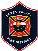
Estes Valley Fire Protection District Organizational Chart