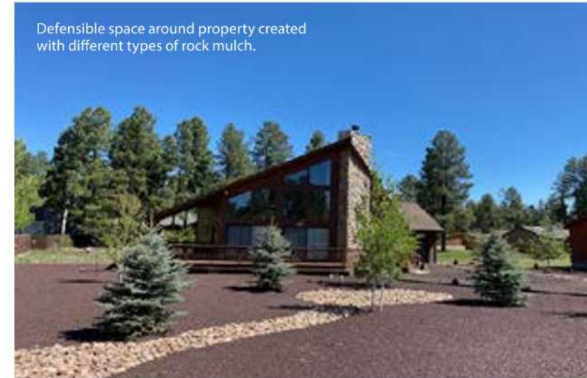
Defensible space around property created with different types of rock mulch.

Ready begins with property owners taking action.