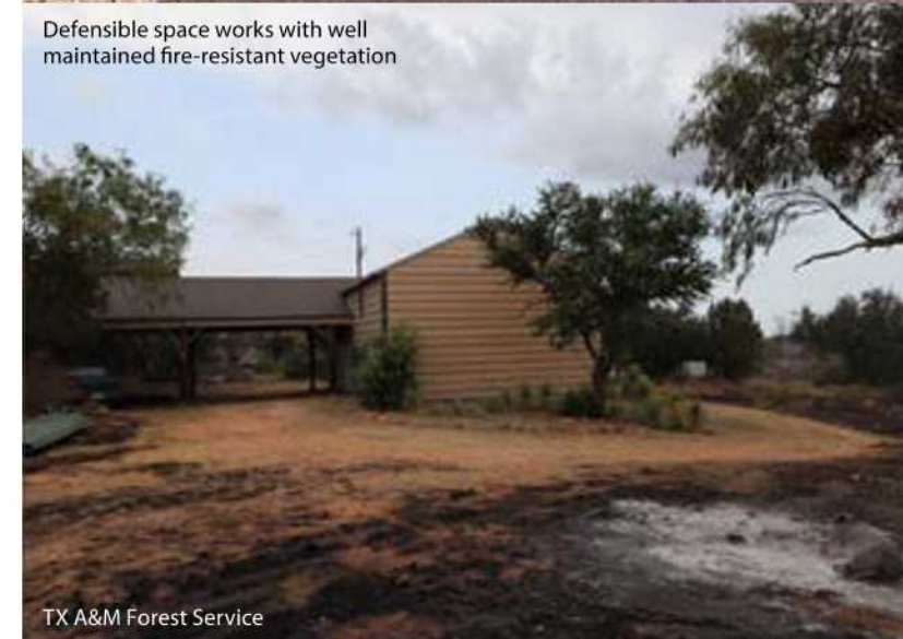
Defensible space works with well maintained fire-resistant vegetation