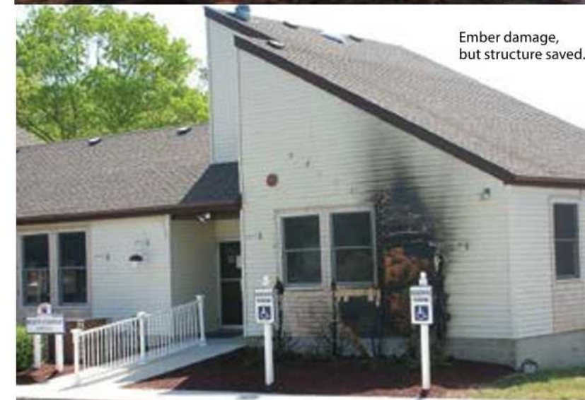
Ember damage, but structure saved.