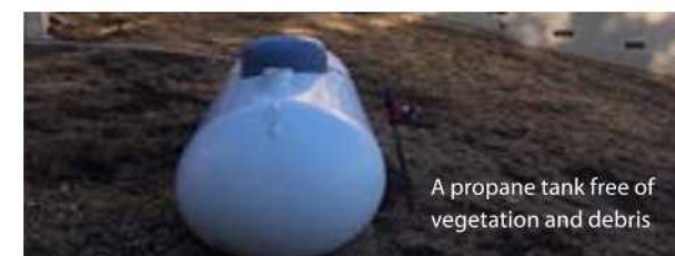
A propane tank free of vegetation and debris

Propane tanks can pose a specific fire threat to your home and property if not properly treated. Use rock mulch or other noncombustible material around the tank to help prevent vegetation growth. Regularly clear debris and any vegetation within a minimum of 10 feet around your propane tank, and do not store anything combustible in this area.